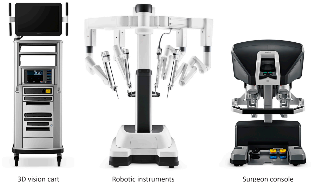
Figure 1. da Vinci robotic surgical system

The da Vinci robotic surgical system helps your surgeon do minimally invasive surgery. They use an advanced set of instruments (Figure 1). The machine gives the surgeon a 3D high-definition view of the surgical area that is magnified 10 times larger. With this technique, the surgeon can view and operate inside the chest using a camera scope and robotic instrument arms. The surgeon uses the console to guide the device into the chest through a few small incisions. The da Vinci system is designed to mimic the surgeon's hand movements at the console in real time. The instruments move like a human hand, but with a greater range of motion.